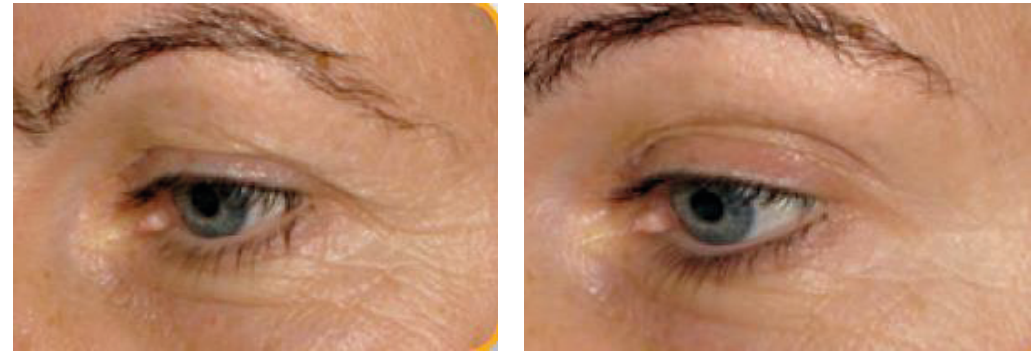
Fig. 1 b

WRINKLE ATTENUATION -20.1% after 8 weeks